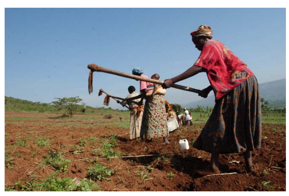
Members of Cyembogo II's Women's Association cultivating the field of one of its members in the early morning.

Climate change is already negatively affecting the lives and livelihoods of poor men and women. Yet it is estimated that less than a tenth of climate funds to date have been spent on helping people in vulnerable countries adapt to the impacts of climate change. The poor are losing out twice: they are hardest hit by climate change they didn't cause, and they are being neglected by funds that should be helping them. Climate finance can and must be made to work from the bottom up, particularly for women smallholder farmers.